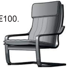
Table 1: Fixed costs

Currently, PF sells 200 chairs per month. Each chair sells at an average price of €100. Below are the forecasted fixed and variable costs for 2019.